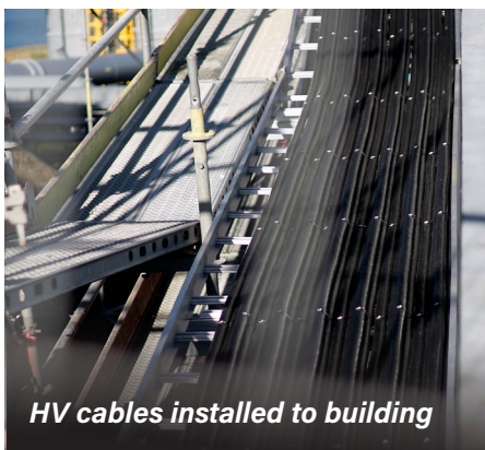
HV cables installed to building

These cables are now delivering power from the transformers to the building and its equipment, forming the backbone of the facility's operations.