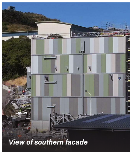
View of southern facade

The facade is almost completed, aside from the final curtain wall above the entrance.