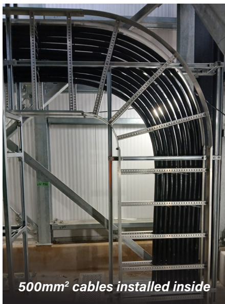
500mm² cables installed inside

Did you know that most industrial processes, including the new Moa Point Sludge facility use 'three-phase power' as it is the most efficient?