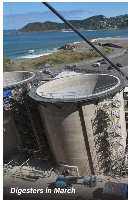
Digesters in March

Now the scaffolding's gone there is room for concrete bases to be poured and new silos to go in.